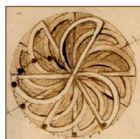
LEONARDO DA VINCI, CODEX ATLANTICUS (1494)